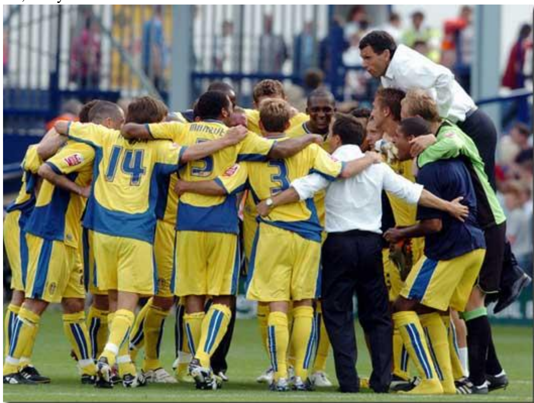
The United party celebrate opening day success at Tranmere

Another late goal, but this time with 12 minutes remaining, was enough to see off Macclesfield in a midweek Carling Cup-tie and then came a tremendous 4-1 victory against Southend United.