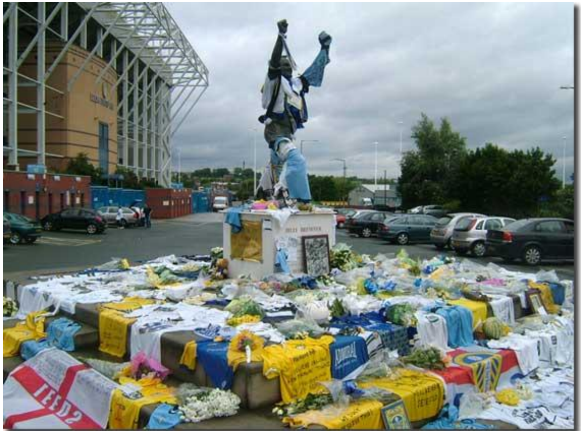
The statue of Billy Bremner bedecked with flowers, shirts and messages of support - July 2007

So crippling was the wrangling that followed Leeds United's decision to enter administration in the spring, that it would be difficult to imagine how the club's preparations for the 2007/08 season could have been less ideal. At a time when the Elland Road club desperately needed to pull together, they were in the gravest danger of falling apart completely.