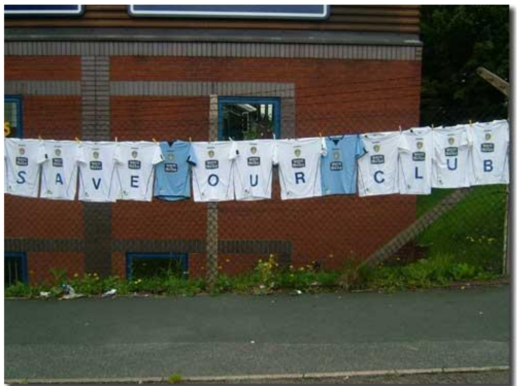
July 2007 - a clear message from the fans outside Elland Road

The management claimed it as a show of support. The protesters were quick to disabuse them, as reported in the Evening Post: “Leeds United fans reacted with dismay today to what they saw as the club's attempts to hijack a flower power protest staged at the Billy Bremner statue on Elland Road ... the official website was quick to claim the laying of flowers and shirts as a spontaneous show of support for the current regime, ignoring the fact that many of the messages penned alongside the flowers and shirts call for chairman Ken Bates to go.”