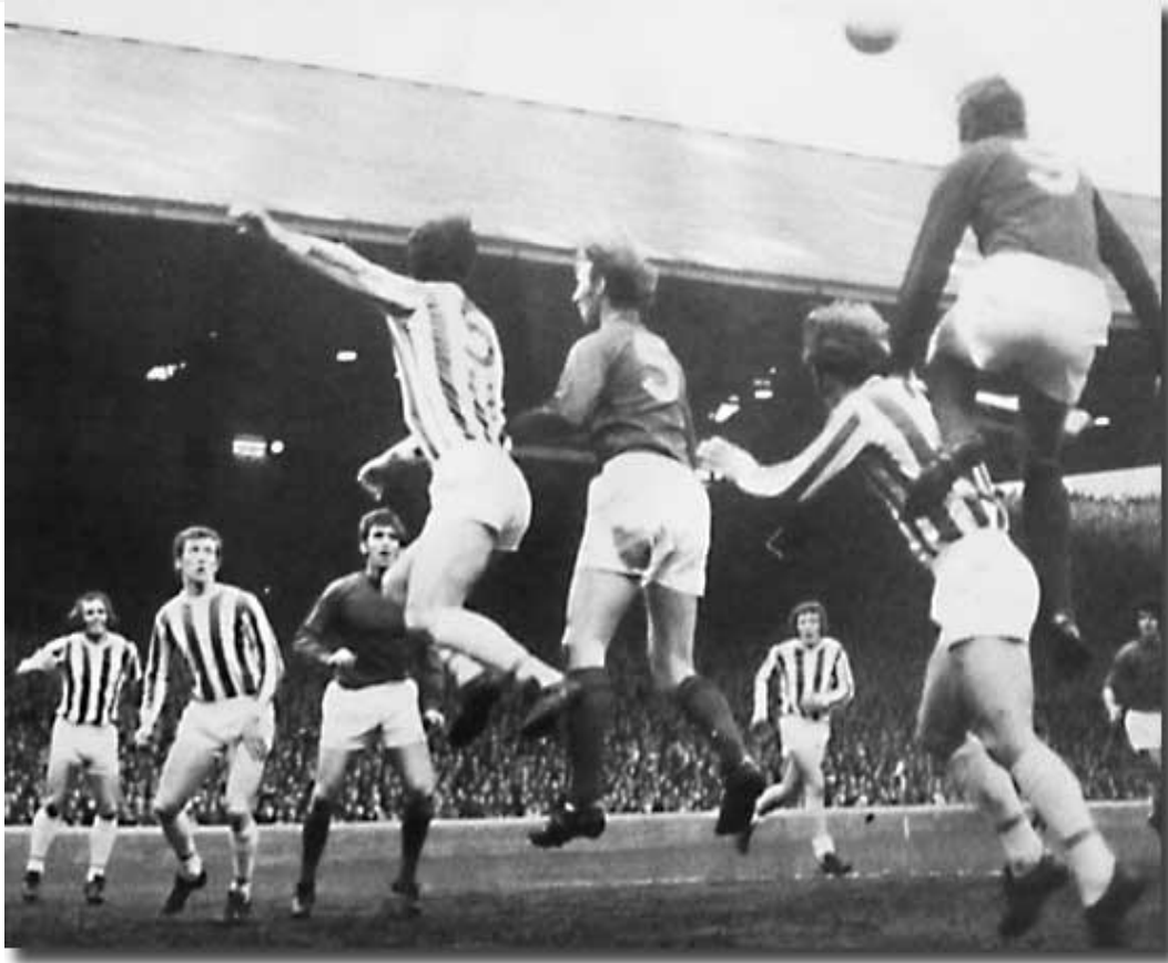
Mick Jones and Jack Charlton press the Huddersfield Town defence at Leeds Road on 12 April