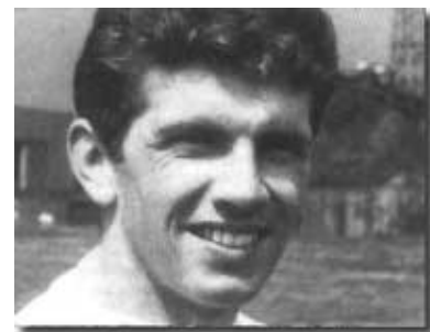
A whole new opportunity opened up for Johnny Giles after he took on the playmaking role in the absence of Bobby Collins

“Johnny would drop back deep to gain possession and ping the ball here, there and everywhere with great accuracy whereas Billy could do things with the ball I could only dream about. He would do the unexpected and score spectacular goals. Johnny was the one that few people in the crowd really noticed whereas Billy, being a fiery character, almost always took the eye. Billy was an inspirational player who would have you on the edge of your seat. He was exciting to watch whereas Johnny controlled midfield in a less energetic way. The combination was extremely efficient and productive. Both were able to dictate a game.