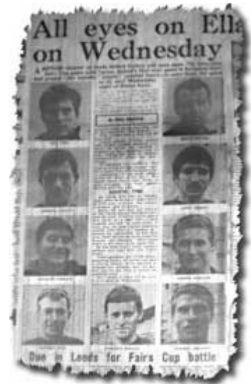
Yorkshire Evening Post 25 September 1965 - previewing the forthcoming clash with Torino and introducing the players