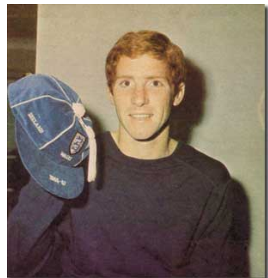
Alan Ball with one of his early England caps - the fiery midfielder was the subject of a long running hunt by Don Revie

20-year-old Blackpool winger Alan Ball, a fiery, hard working dynamo, had already broken into the England team. The redhead had impressed Revie during United's clashes with the Lancashire club and was one of the most promising young talents in the country. He was much sought-after and would not come cheaply, but Revie managed to persuade the Leeds directors to underwrite a move. Their resources had been swollen by record profits of