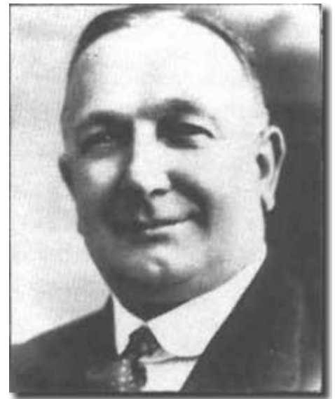
Northampton Town’s Herbert Chapman was finally revealed as the new City manager at the beginning of May

Chapman would certainly need “the best of luck” at Leeds. He had but a couple of weeks to ensure that the City club would be able to garner sufficient votes to ensure that they remained members of the Football League. On the evidence of the disastrous season they had just experienced, retention of their status might only lead to further humiliation and Chapman had much work to do.