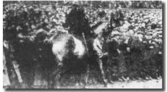
Mounted police struggle to keep the crowd off the Elland Road pitch in the FA Cup replay between Barnsley and Bradford City in March 1912

When it became clear that demand for admission far exceeded the capacity, ground officials again decided to lock the turnstiles, denying thousands the opportunity to witness what was expected to be a thrilling encounter. Frustrated by the move, a furious mob stormed the Elland Road end of the ground and forced their way in. Tragedy could have resulted as those already inside were forced forward by the rush, pouring over the rails and onto the pitch. They swarmed across the playing area and assumed possession of the main stand with its empty seats, awaiting the arrival of spectators with reservations. The police were helpless in the face of the mass hysteria and could not prevent the theft of a cash box containing more than £100. Three thieves were detained and were convicted at Leeds Town Hall later in the week.