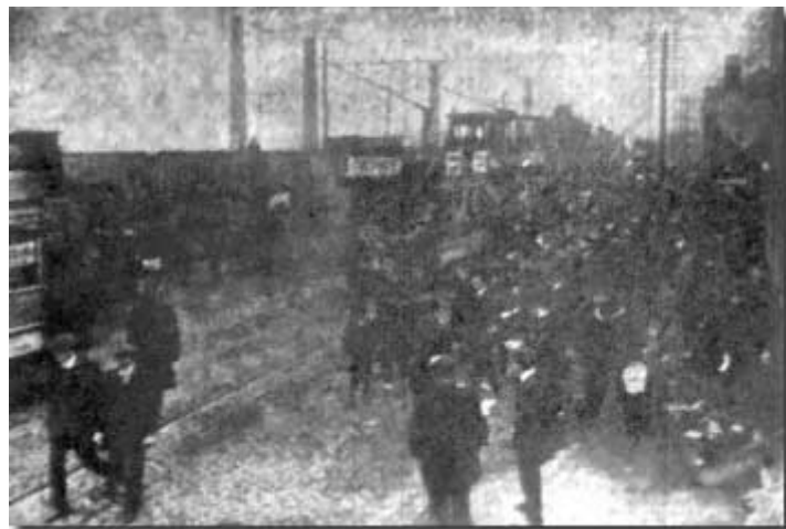
The scenes outside a packed Elland Road on the day of the chaotic staging of the 1910 FA Cup semi final tie between Barnsley and Everton