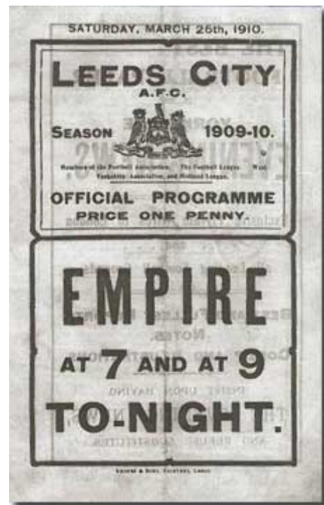
The programme issued for the Elland Road FA Cup semi final between Barnsley and Everton on 26 March 1910