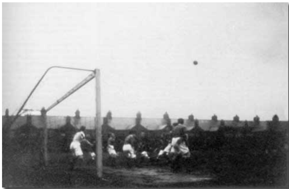
Leeds City attack the Leicester Fosse goal during the draw on the last day of the 1909/10 season