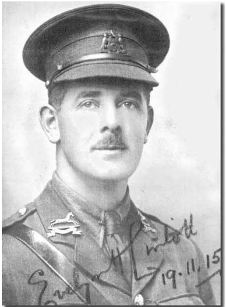
Lintott in November 1915

Thus passed a remarkable footballer and all round great man.