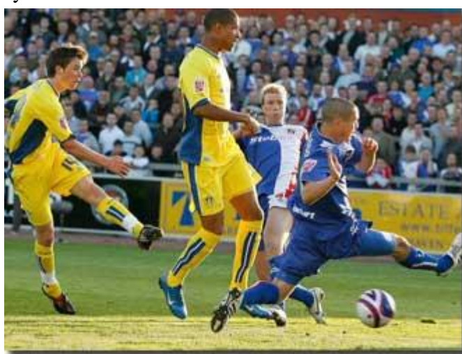
Jonny Howson gives United the lead after ten minutes at Brunton Park

Casper Ankergrén's long goal kick drifted across to David Prutton on the left. The midfielder nodded it to Jermaine Beckford in the centre. He challenged for the dropping ball and flicked on to Jonny Howson, bursting through from midfield. Howson played it out wide to Freedman on the left and the Scot instantly cut the ball back to the centre of the box where Howson, continuing his run, chested it on and slotted home left-footed to bring Leeds back on level terms. It was a hammer blow to Carlisle, whose confidence was visibly shaken.