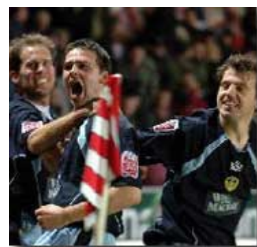
Lewis, Healy and Blake celebrate an astonishing comeback

With four minutes to go, and only fifteen since they had been 3-0 down, Leeds snatched a fourth goal. Rob Hulse pulled the ball back across the area from the right and a deflection took it right to Liam Miller around the penalty spot. He drove it home precisely with the outside of his left foot, leaving Niemi completely flatfooted.