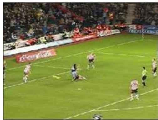
Robbie Blake fires home the second goal at Southampton

Even though the ever optimistic United fans chanted gleefully, "We're going to win 4-3", it looked like the goal would be a mere consolation. However, it brought divine inspiration - all the confidence came flooding back into a resurgent Leeds as the Saints started to wobble. Harry Redknapp: "They got nervy. Who knows why? But the team was still dominating. They didn't start suddenly to hammer us. We had corner after corner."