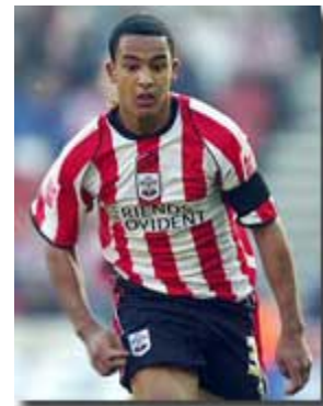
Saints starlet Theo Walcott had terrorised United at Elland Road earlier in the season