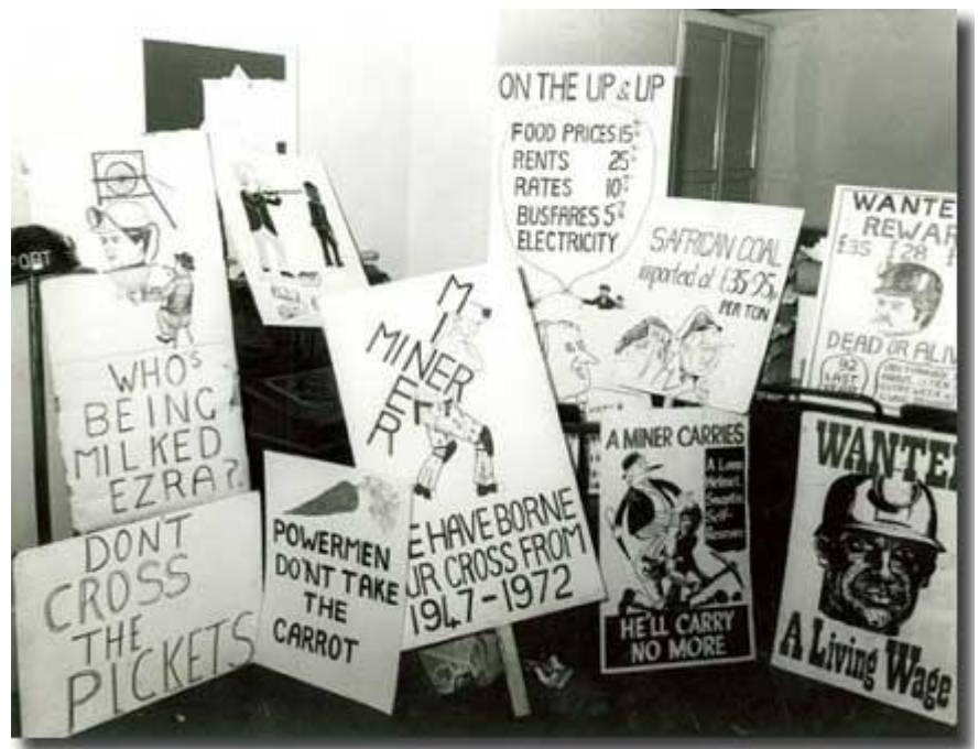
Miners' placards from 1972