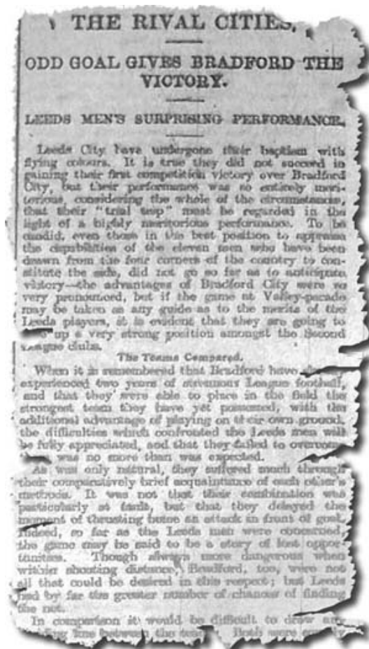
The Leeds Mercury of 4 September, the Monday after the game, carried extensive coverage

Leeds City were very much up and running.