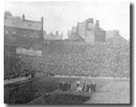
The Valley Parade stadium in 1908 - the picture was taken after significant improvement work was carried out at the ground