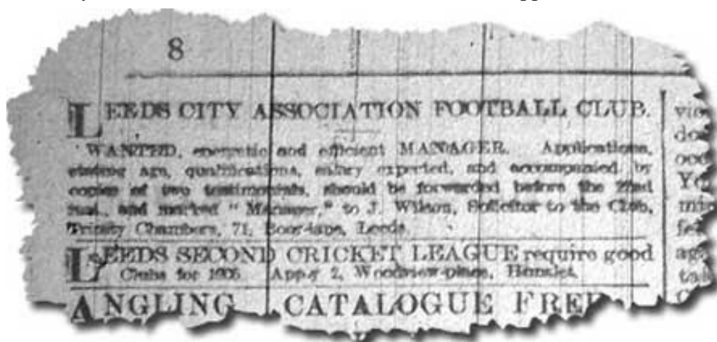
Yorkshire Mercury 13 February 1905 - The advert for a manager for Leeds City

"He has attended the meetings of the League for the past six years, and is well appointed with club secretaries, whilst his knowledge of players and the arrangements to be made for securing admission to the competition will be of great service to the Leeds Club.